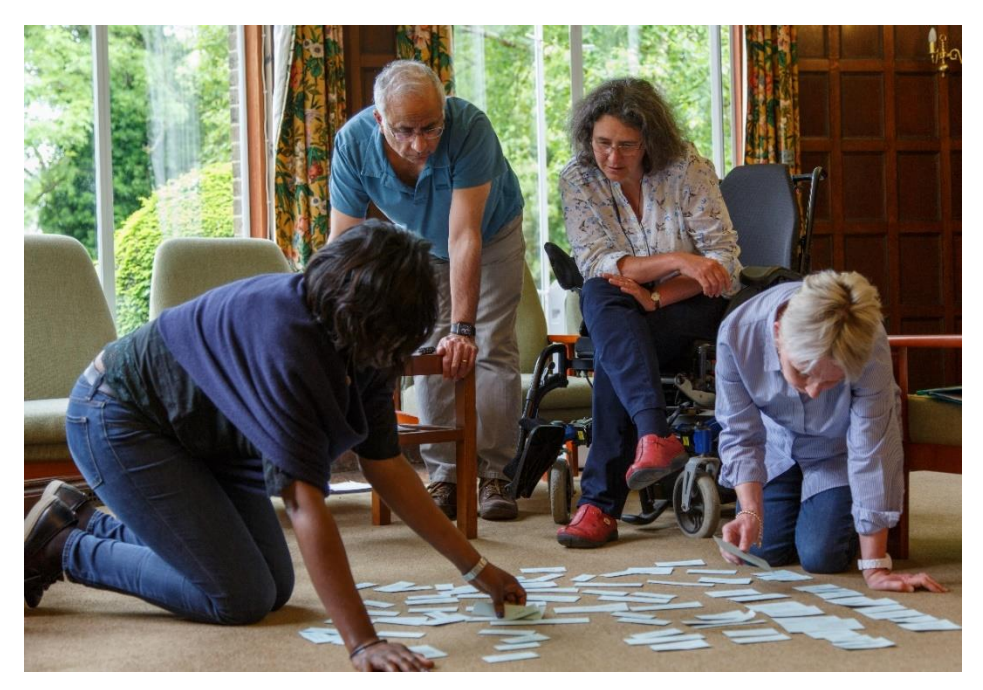
Students at work

Growing in faith and learning about scripture and the tradition of the Church is challenging, testing and (usually) great fun! It will engage your heart and mind and enhance your spiritual development.