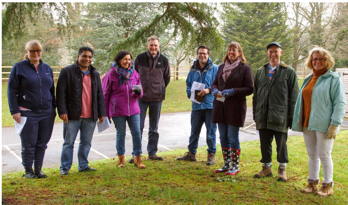
Students at a residential weekend

Self appraisal is also a key part of the process. This is a major component of the appraisal interview at the end of each year with the LMP Dean and Year Tutor. We see appraisal as a healthy and natural process and it is embraced and exercised in a positive manner by all students and staff. It will inform the final report sent to the Bishops.